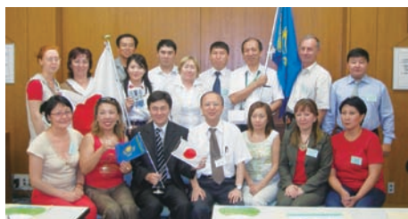
At Idemitsu Kosan Co., Ltd., Aichi Refinery