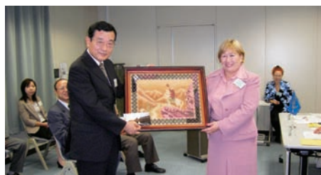
Presenting a commemorative gift (Sept. 2006)

visited such companies as Nippon Petroleum Refining Co., Ltd., then-Catalysts & Chemicals Industries Co., Ltd., and Idemitsu Kosan Co., Ltd. Each of the companies provided detailed lectures and explanations of issues concerning heavy oil upgrading.