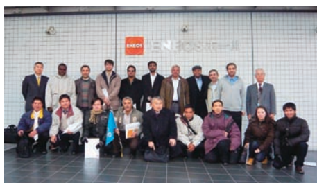
At Nippon Petroleum Refining Co., Ltd., Negishi Refinery

My mother and I, as well as my husband, deeply appreciate the dedicated hospitality with which JCCP and other companies have received us, and intend to apply our Japanese experience to our jobs and lifestyles. Thank you very much.